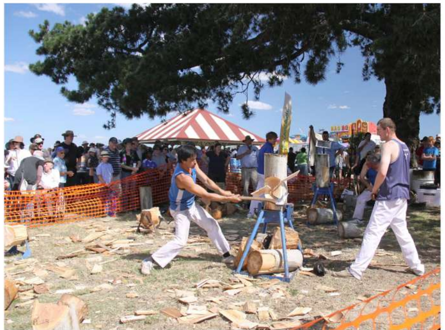
Clunes Show.